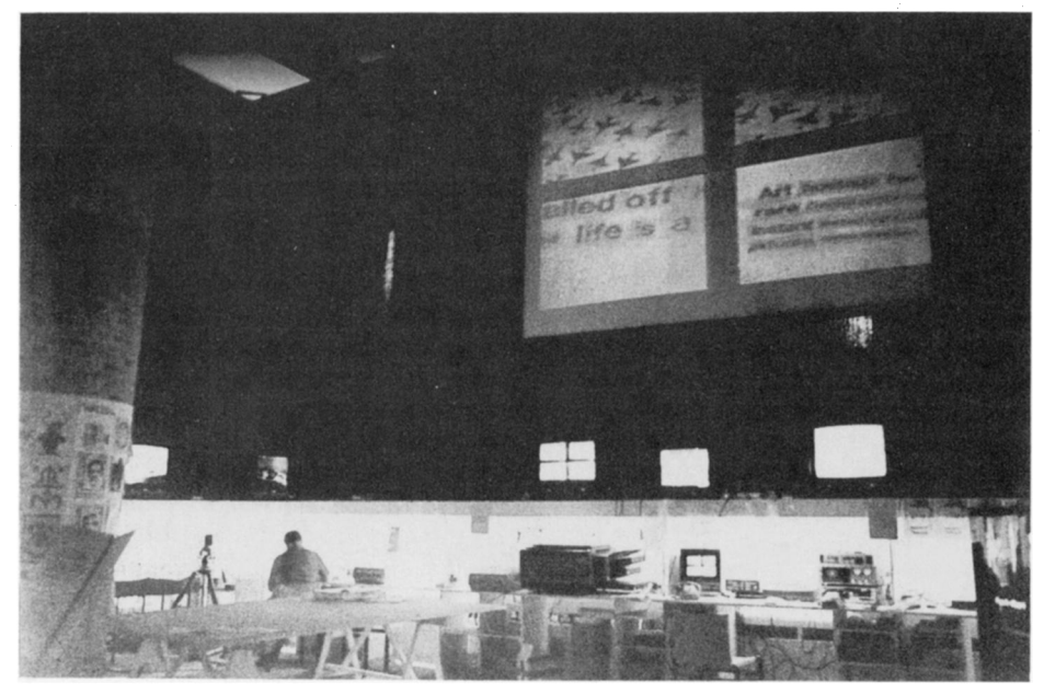
Figure 1 View of the "Laboratory Ubiqua" (planetary networking and computermediated systems), Venice Biennale, 1986.