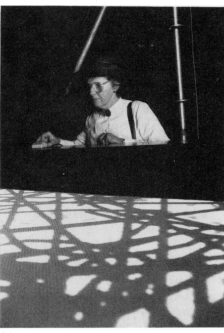
Figure 3 Roy Ascott, Aspects of Gaia (upper level), 1989, computer-mediated interactive installation. From the "Ars Electronica" exhibition, Linz, Austria, 1989.

The design and production of the interface as a whole—involving the collaboration of artists and technicians working with